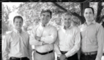
Family Owned Since 1896

Schmitt Music is your trusted, full-service, family-owned and operated music store!