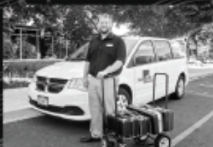
Regular School Visits