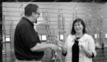
Friendly, Expert Staff

Schmitt Music offers the very best selection of band and orchestra instruments, acoustic pianos, digital keyboards, sheet music & books, accessories, music lessons and more. Every year we help more than 13,000 students join their school music programs.