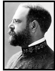
John Philip Sousa 1854 - 1932

However, marches existed long before Sousa : the earliest known notated marches date from the early 16th century. Composers of all genres have written marches either as stand-alone compositions or as movements or sections of larger works.